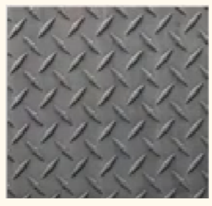
Ques 2. Identify the building material: